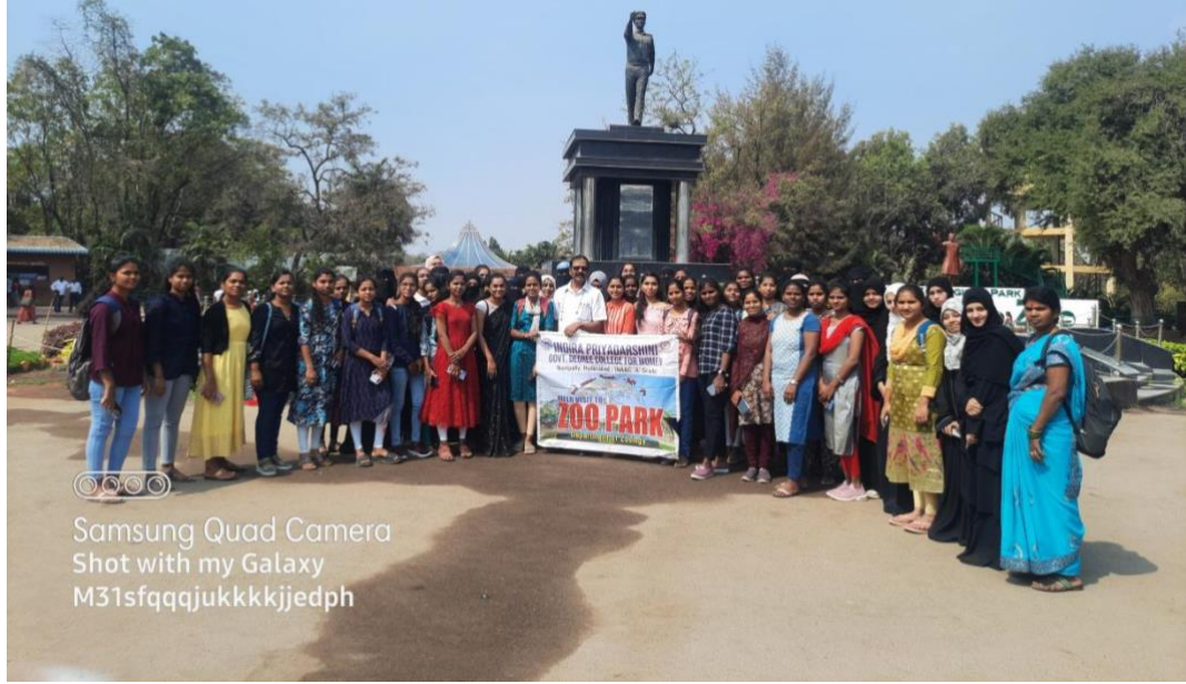
Shot with my Samsung Quad Camera Shot with my Galaxy M31sfqqqjukkkkjedph